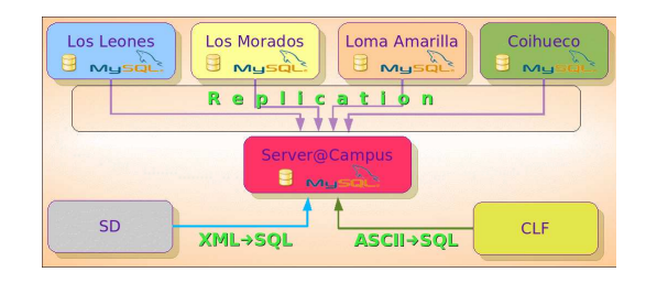
Figure 2: Organisation of the databases: The single databases at each FD-building are replicated to the database server at the central campus, while other sources like SD fill directly into the database.

LIDAR: the LIDAR [3] monitors the atmosphere especially close to the telescopes.