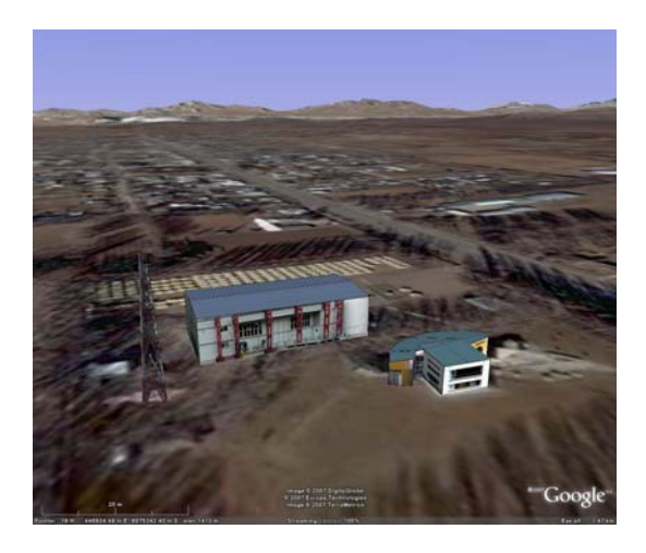
Figure 2: Google Earth image of the Auger office complex and assembly building in Malargüe.

all the Observatory's structures from above using customized Google Earth tools developed by Auger collaborators [2]. When "flying over" any detector or building in the latter display, an explanatory pop-up box is available in English and Spanish. An example of a screenshot obtained with Google Earth is shown in Fig. 2. A visitor can also choose to superpose 3D representations of real high-energy cosmic-ray events detected with the Observatory on the Google Earth display.